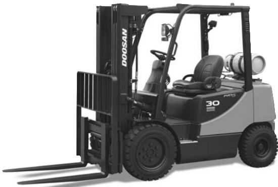
G20E / G25E / G30E-5 G20P / G25P / G30P / G33P-5 & G35C-5 2,000kg 2,500kg 3,000kg 3,300kg 3,500kg LP, Pneumatic Tire