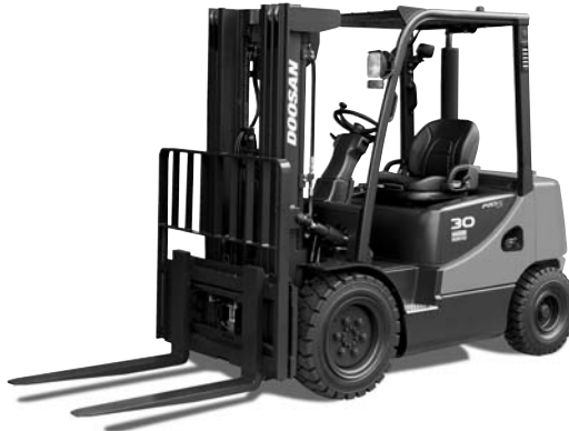
D20S / D25S / D30S / D33S-5 & D35C-5 2,000kg 2,500kg 3,000kg 3,300kg 3,500kg Diesel, Pneumatic Tire